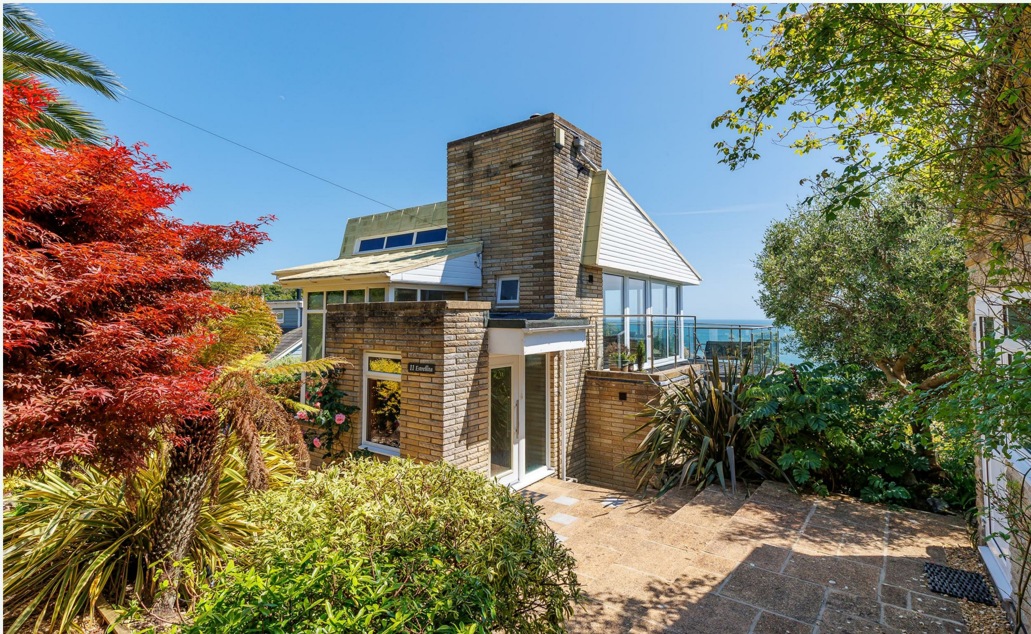
Estrellita, 11 Castle Close, Ventnor, Isle of Wight, PO38 1UD